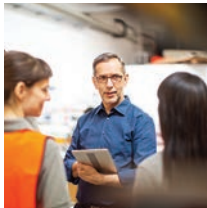
ILLUSTRATION & MULTIMEDIA

Whether you need us to create new content or enhance your legacy data, ONEIL maximizes value with integrated solutions tailored to your specific requirements. Our team of project managers, technical writers, catalogers, and illustrators simplifies the process with decades of experience and valuable mechanical, engineering, and military backgrounds.